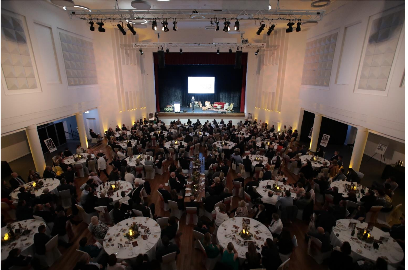
Sir Bob Geldof – Round Table Dinner Event plus Stage