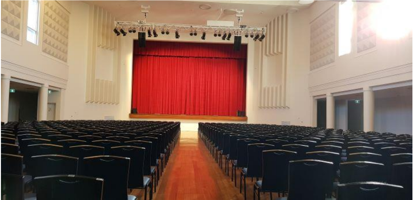
Theatre seat setup

Here are some examples of what the Civic Hall can achieve, from round table functions, theatre & live music, dances and exhibitions.