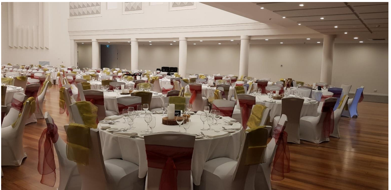
Round Table Dinner Event