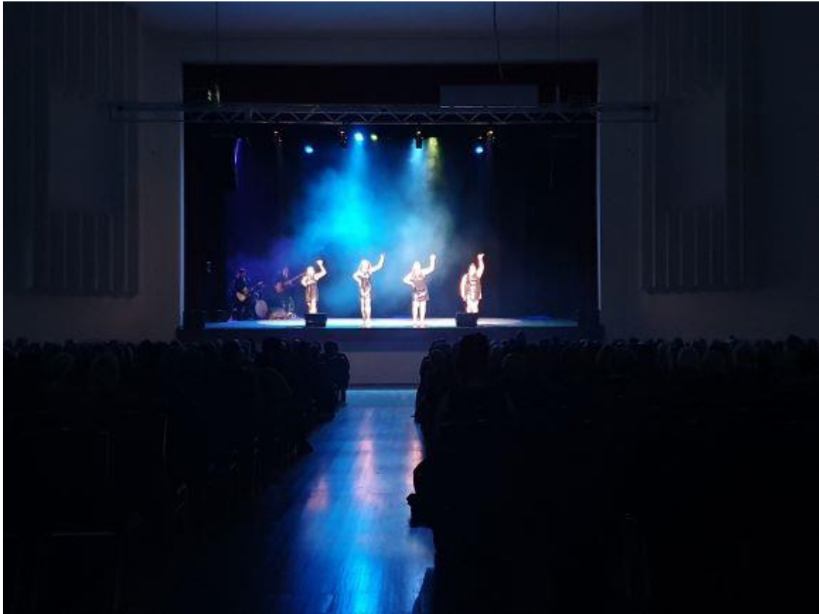
Live Music Performance