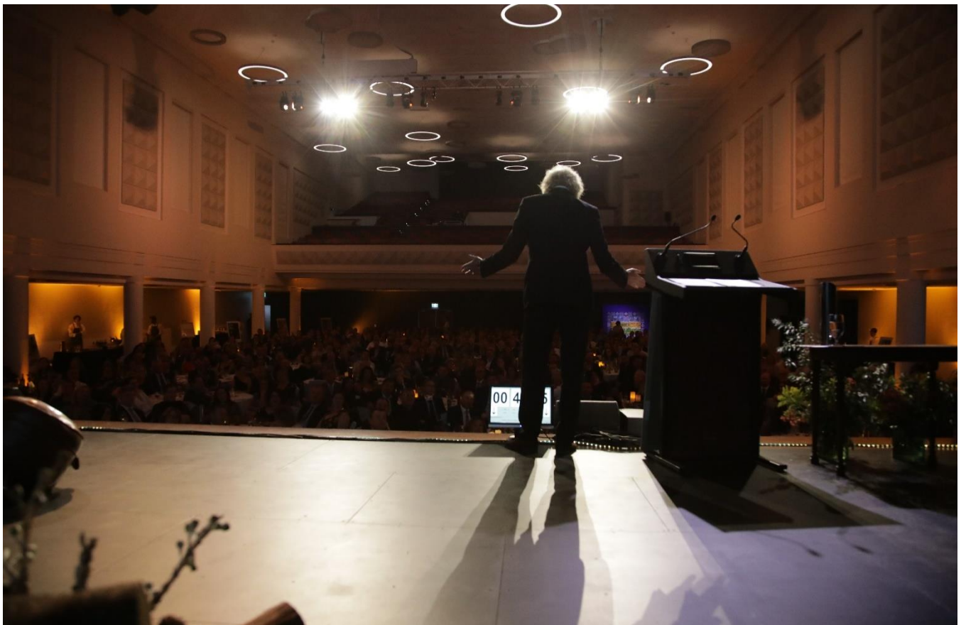
Sir Bob Geldof – Round Table Event