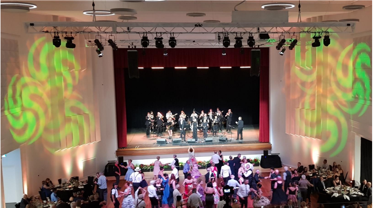
Round Table Dinner and Dancing