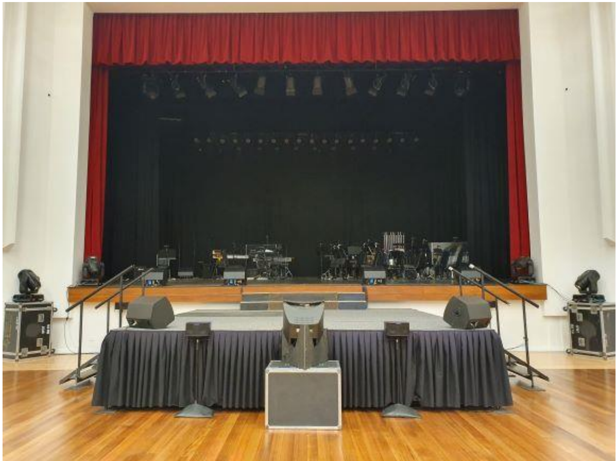
Theatre Performance Setup